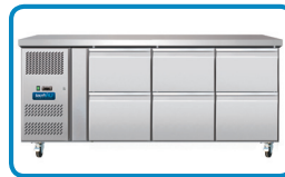
retrofit option drawer sets