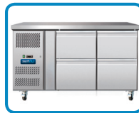
retrofit option drawer sets