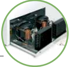
Slide out condensing unit for easy servicing